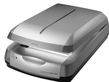
USB Scanner with Transparency Adapter (FireWire scanners connect to FW ports)