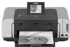
Color Photo Printer (Some printers have a built-in card reader.)

Used to connect all external devices, as shown.